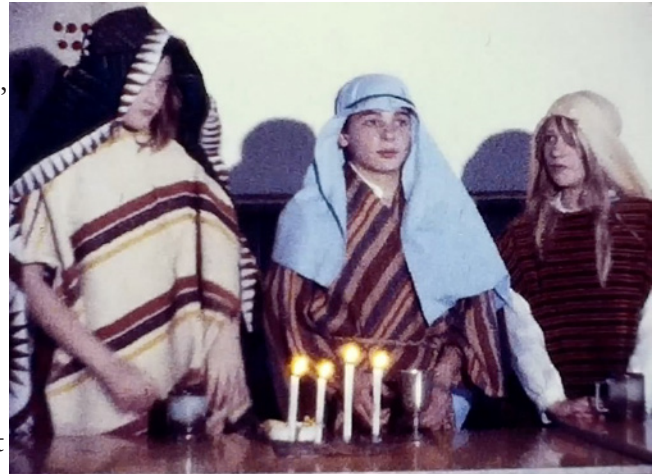
A still from "The Last Supper" portion of the 1981 film. https://youtube.com/F3LGzIXbSI4

If this is the film's premiere, forty years later, it cannot come at a more needful time. We may be emerging from the grip of a pandemic, but we still are unable to pursue such a project for retelling our central Story ourselves. Instead, we are blessedly charmed and inspired by the resourcefulness and creativity with which a score of young people and their Sunday School teachers chose to depict the central Story of our faith. Our thanks go to all of them, here four decades later, and to Ian for taking up this project.