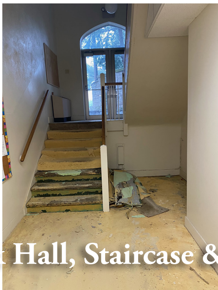
The Back Hall, Staircase & Library